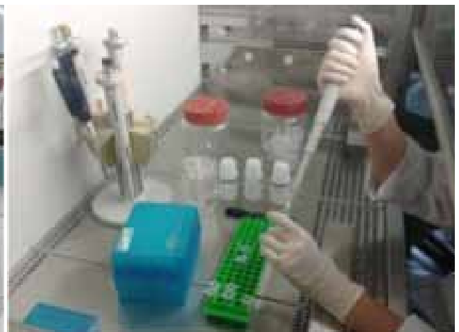
Dung sample of Sumatran rhino in Way Kambas National Park (Photo: Udayan Borthakur); Rhino faecal sample (Photo Courtesy: Eijkman Institute for Molecular Biology); DNA extraction process (Photo Courtesy: Eijkman Institute for Molecular Biology).