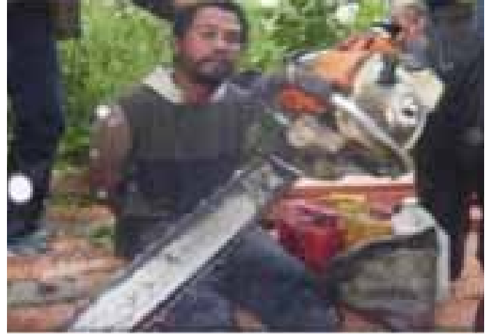
Illegal logging suspect arrested with chainsaw.