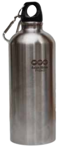
Drink Bottles – $13