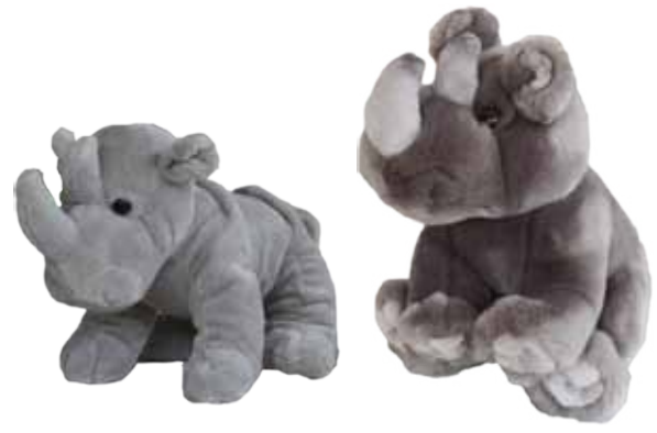
Rhino Soft Toys – $20ea