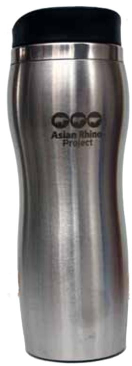
Thermal Mug – $15