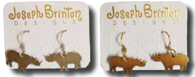
Rhino Earrings – $20