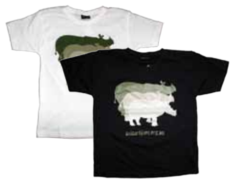
ARP T-shirts – $19