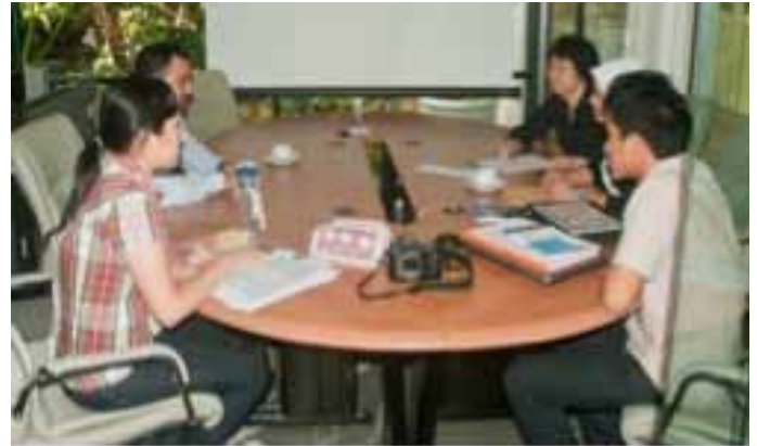
Scientists and researchers from Aaranyak, YABI and Eijkman Institute meeting to discuss Sumatran rhino genetic analysis in Eijkman Institute, Jakarta.

The conservation impact of this project is yet to