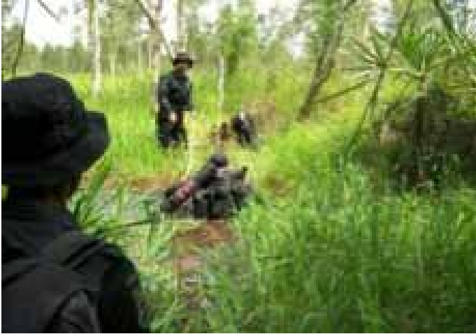
RPU members cross river in route to apprehend illegal logger.