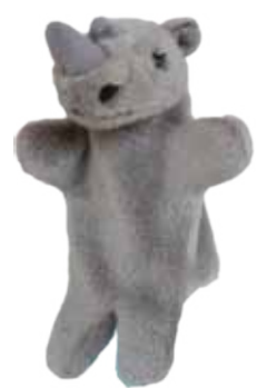
Rhino Hand Puppet – $15